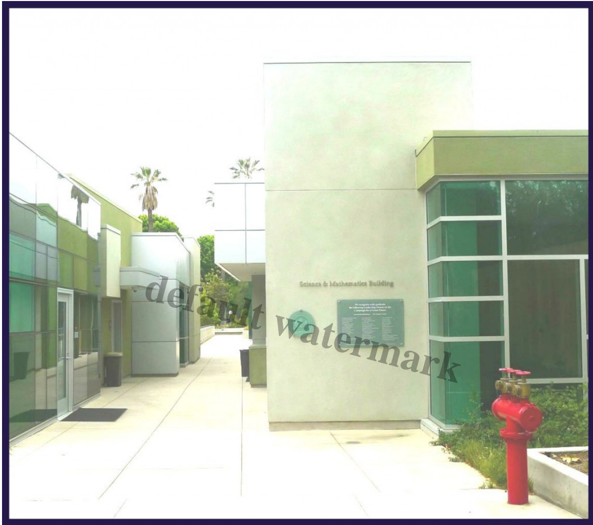
The Science and Math Building

As I walked around the campus, not really wanting to leave the quaint oasis, we entered the incredible new upper school science and math building, a 14,000 square foot, two story space where students “do science, not just study it.” (Westridge School). It is filled with chemistry labs, math classrooms, physics labs, technology and a data center to support the school’s 150 laptops. The eco-friendly quality of the building (it is a Platinum LEED-certified project) allows for teaching about green technology and environmental education.