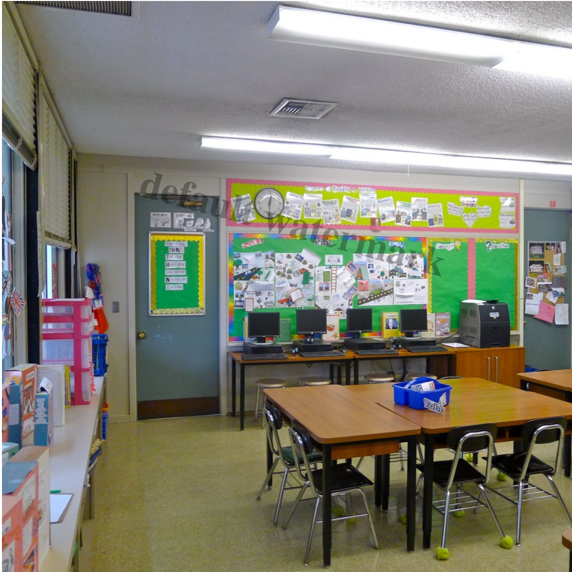
Lower School classroom

Simply put, Westridge is astounding! The breath of programs and the warmth of the school are impossible to overlook. It boasts some formidable advantages, including very robust, state-of-the-art signature science and arts programs, a college preparatory curriculum, and top-tier faculty, many who have advanced degrees.